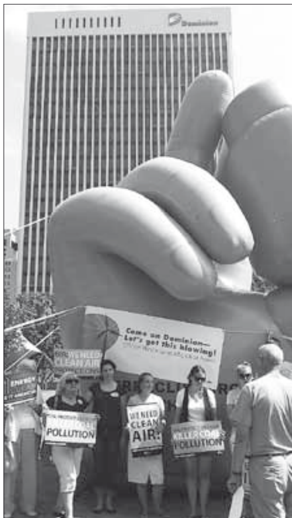
Activists on the Road to Clean Energy Tour visit Richmond August 17. The inflated inhaler makes an impression even in front of the tall Dominion Virginia Power headquarters.