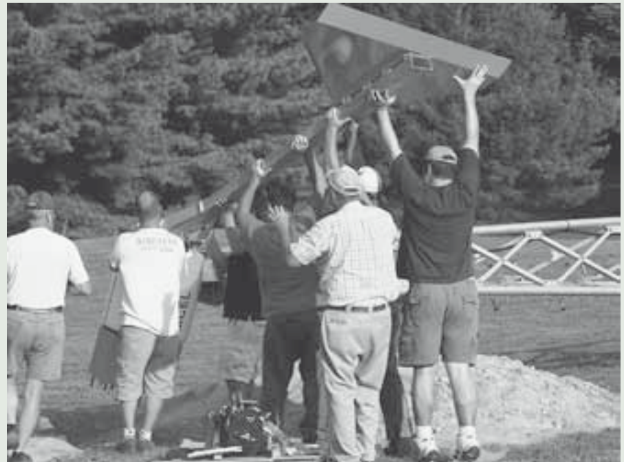
As the result of Roanoke County’s passing a small-wind zoning ordinance this past spring, a turbine was installed at a private home near 12 O’Clock Knob. Local volunteers and wind activists came for a modern barn raising to help install the 10 kilowatt turbine.