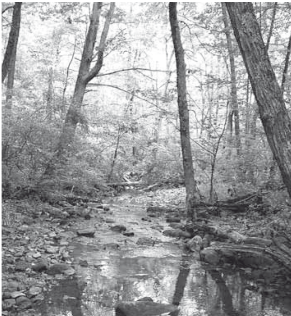
A stream runs through the Lee Ranger District of George Washington National Forest.