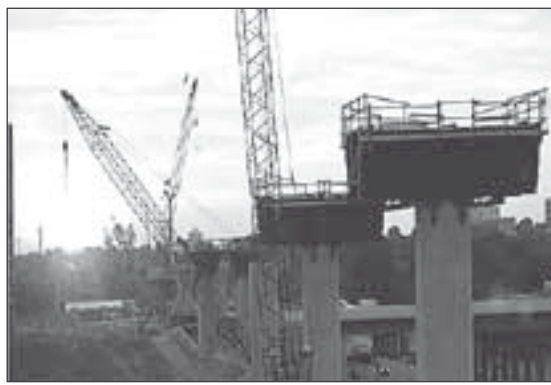
DC Metro construction

However, it seems apparent Governor McDonnell’s administration is willing to hold the project hostage to the point of risking its failure, and leverage the broad local support for the Silver Line to extract a concession to drop the mandatory PLA as sought by the Airport Authority. Insisting that Phase II use non-union labor has