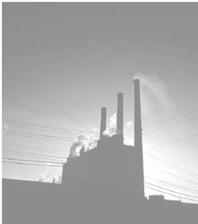
The GenOn Potomac River Generating Station, which has been spewing dangerous pollutants into Alexandria's and Washington's air for many years, will soon be fading from existence.