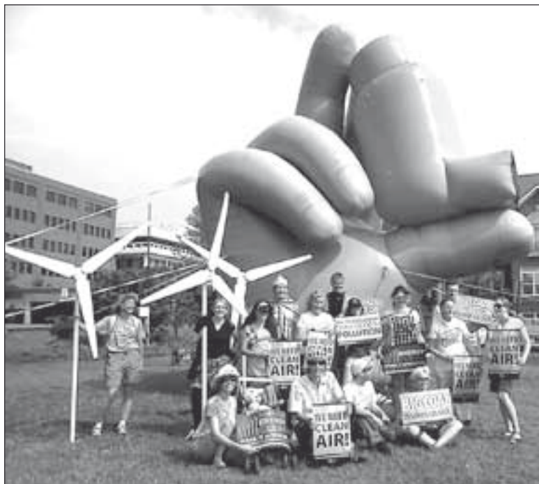
The Tour in Alexandria