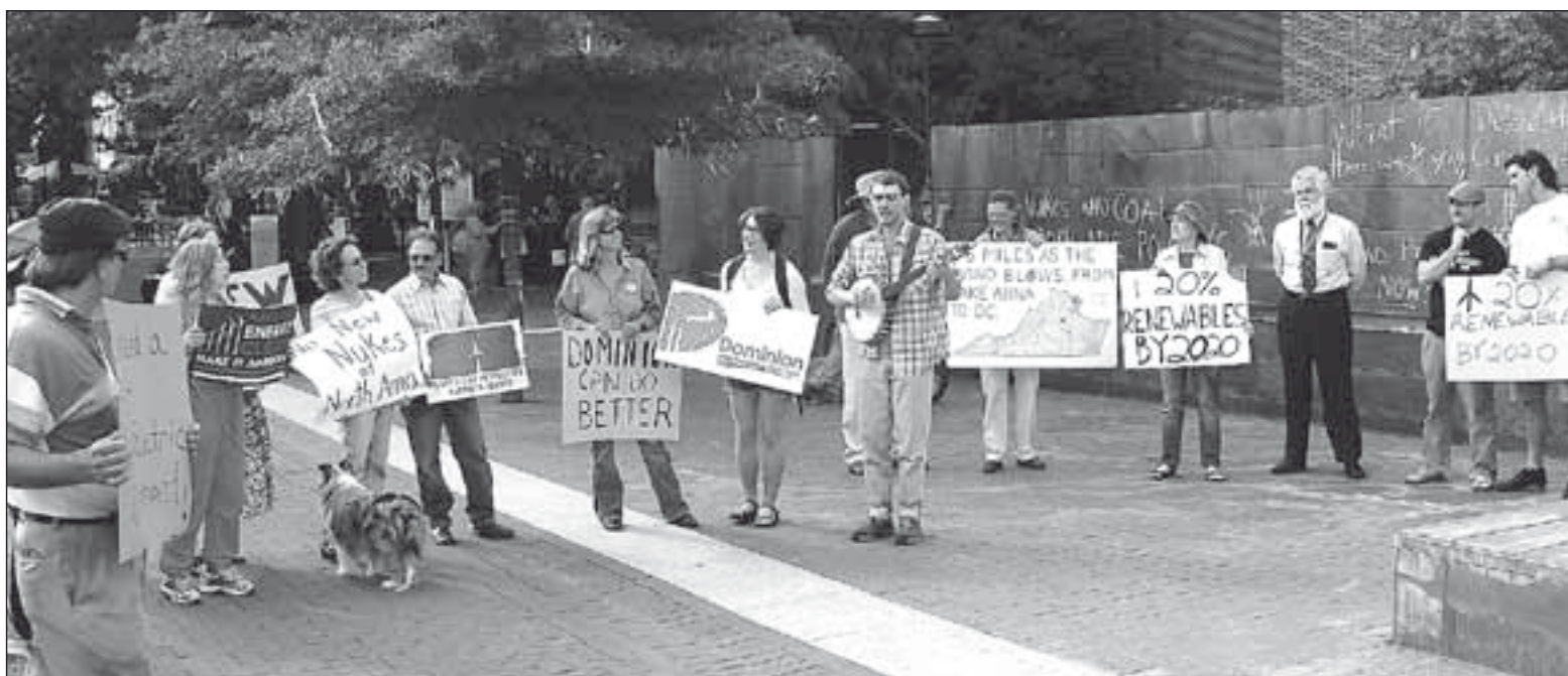
On May 11 demonstrators at the Free Speech Wall in Charlottesville show Dominion Virginia Power shareholders their views on sustainable energy. The shareholders' meeting was held the next day at the Boars Head Inn.